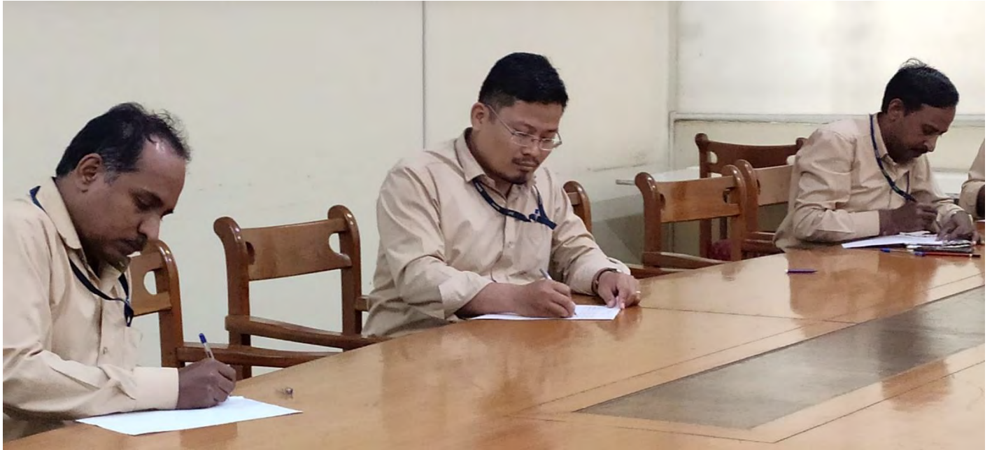
Judging of the Competitions by a committee